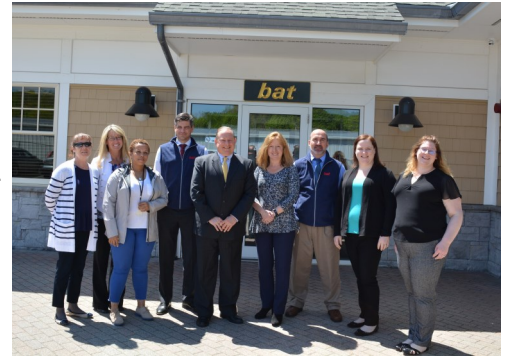
Brockton Area Transit Authority employees have embraced workplace wellness.

Q) What has been the most popular employee wellness program?